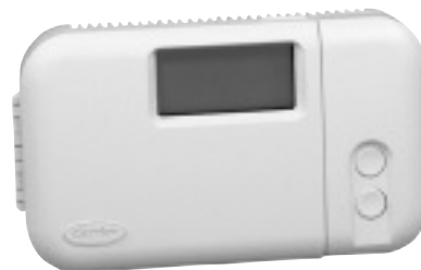
Programmable TSTAT thermostat